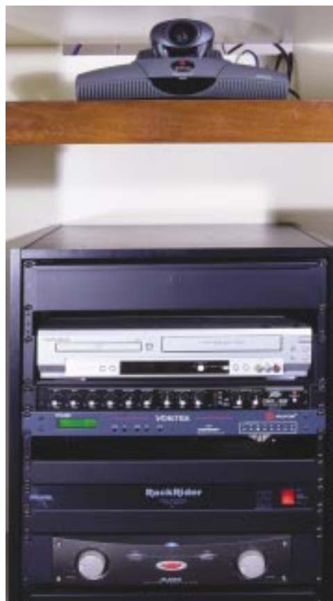
A streamlined rack of source equipment is easily accessible at the front of the room.

To simplify the system's operation, Neal used the switcher on auto switch mode to enable VGA signals, regardless of source, to be selected and transmitted to the projector. However, the computer audio and video signal from the Epson ELP-DC02 document camera also needed to be addressed. Neal used a pair of Intelix V2A2 balun devices to solve the problem.