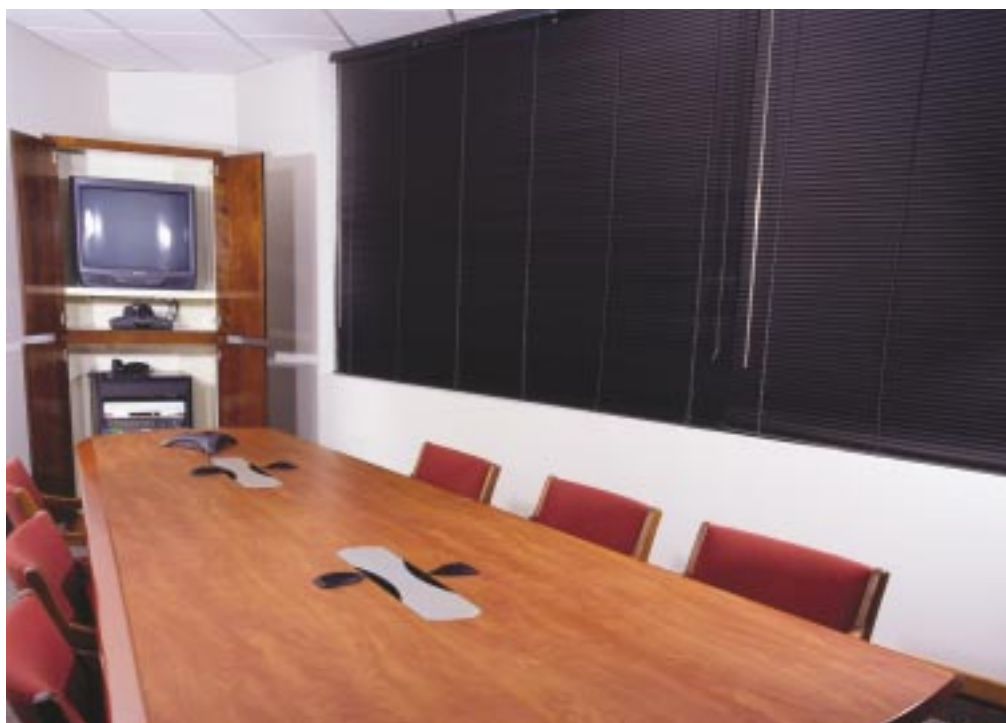
By using the right equipment and system design, Sacramento-based integrator MCSi was able to compensate for the triangular room's shape and small size to create a more hospitable conferencing environment.

Even without the luxury of early design involvement, choosing the right equipment helped transform a hospital's awkwardly designed conference room into an effective AV collaboration and presentation space.