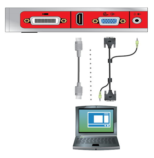
Figure 2. Connections for a RealPresence Group 700 system

Figure 1. Connections for RealPresence Group 310 and 500 systems